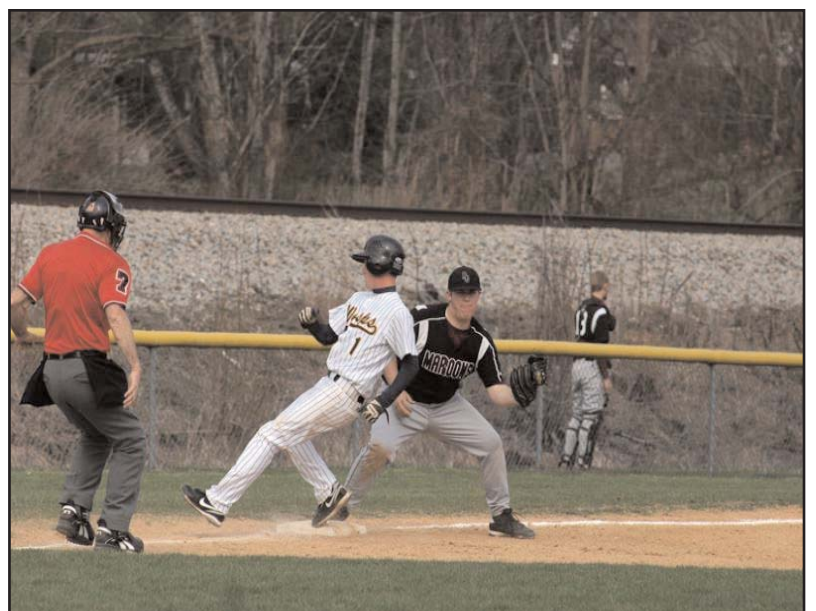
E&H Sports Information

The Wasps' remaining tilts will be at home against out-of-conference foe Virginia Intermont on April 9, before the team will travel to Bridgewater on the following day. On April 13, the Wasps return home to face Washington and Lee, but get a two day break before hosting NAIA opponent UVA Wise.