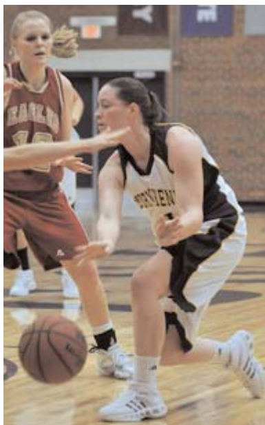
E&H Sports Information

This came just weeks after upsetting the conference's num-